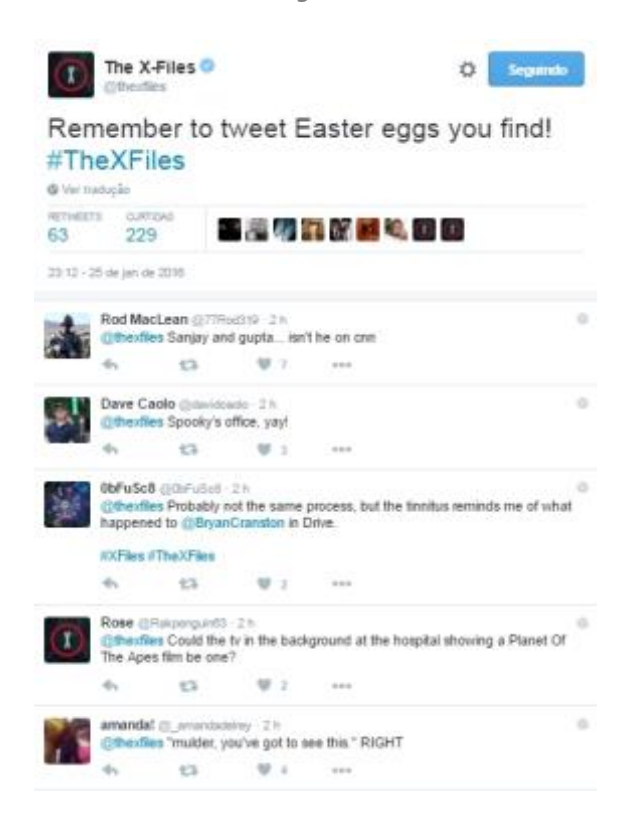
Figure 5: The X-Files profile asks viewers to share the Easter eggs in the episode. By clicking on the tweet it is possible to access the audience's responses.

Sigiliano, D. & Borges, G. (2018). The expansion of the fictional universe of The X-Files on social TV. Dígitos. Revista de Comunicación Digital , 4