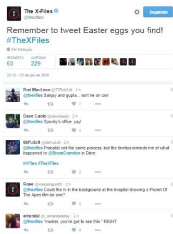
Figure 5: The X-Files profile asks viewers to share the Easter eggs in the episode. By clicking on the tweet it is possible to access the audience's responses.