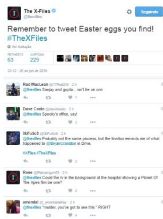
Figure 5: The X-Files profile asks viewers to share the Easter eggs in the episode. By clicking on the tweet it is possible to access the audience's responses.