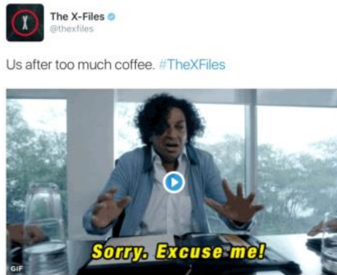
Figure 4: The X-Files profile re-signifies the scene from the ‘ Founder’s Mutation ’ episode.

The use of memes helped propagate tweets in the plot profile by exploring everyday situations such as the grueling work routine, the traffic jam of large cities, and the surplus of coffee. The publications drew the attention of users who were not following the series.