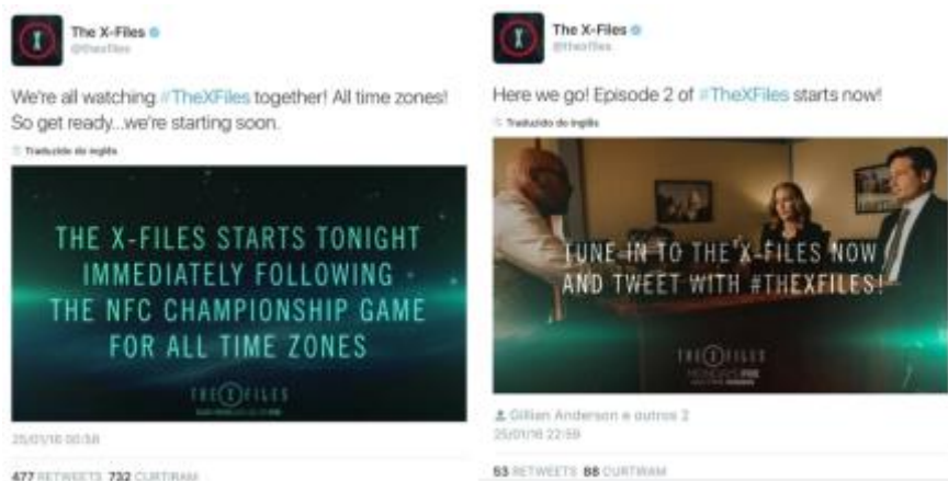
Figure 1: The official profile of The X-Files series highlights the collective experience of television and encourages viewers to share their impressions during the show.

To help propagate the content, the page asked the interacting viewers to retweet (RT) the tweet with the words: ' this person is watching The X-File '. Thus, the audience not only advertised on their timeline that the show was on air but also it could, even indirectly, influence their followers to turn on the TV. The stimulus to the backchannel permeated the Twitter engaging actions of all 10 th season episodes. As the scenes were shown, the @thexfiles profile encouraged interacting viewers to share memes, photos, videos, and especially comments while watching.