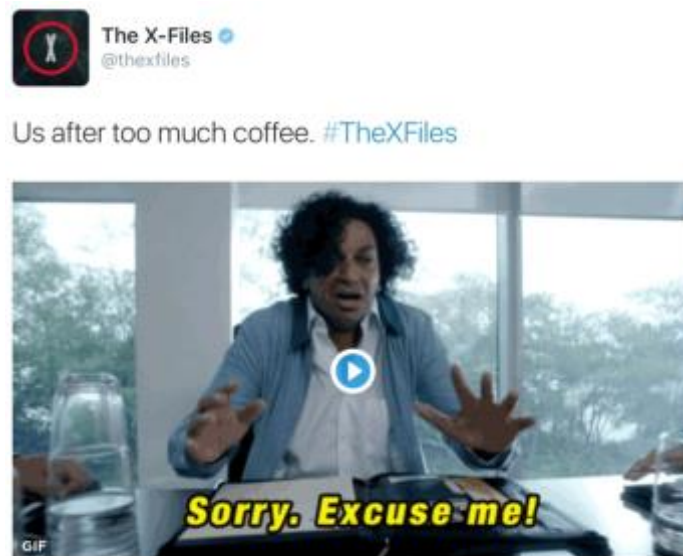
Figure 4: The X-Files profile re-signifies the scene from the ‘ Founder’s Mutation ’ episode.

The use of memes helped propagate tweets in the plot profile by exploring everyday situations such as the grueling work routine, the traffic jam of large cities, and the surplus of coffee. The publications drew the attention of users who were not following the series.