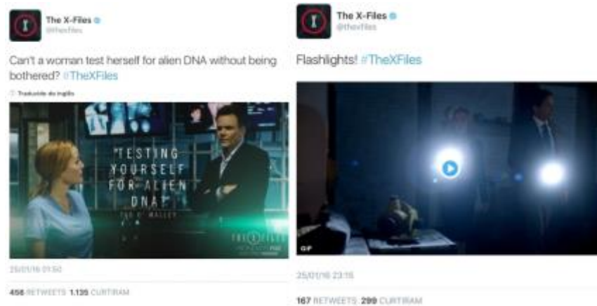
Figure 3: The official profile postings for The X-Files series highlight Scully's (Gillian Anderson) and Tad O'Malley (Joel McHale) dialogue, which is featured in the episode My Struggle and directly influences the series season finale, and the emblematic lanterns of the FBI agents, respectively.

Another strategy adopted by the Twitter profile of the attraction was the introducing of 10 th season new characters. Each appearance of Tad O'Malley (Joel McHale) and Sveta (Sheila Larken) in ' My Struggle ' and ' My Struggle II ' was highlighted by @thexfiles. The tweets contained the picture along with the character's name on the scene helped the audience familiarize themselves with the new reports of the plot. There were also created polls that debated the nature of Tad (Joel McHale) and Sveta (Sheila Larken), the options drew attention to the motives that led the characters to make certain decisions and facilitated interacting viewers understanding.