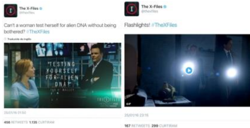
Figure 3: The official profile postings for The X-Files series highlight Scully's (Gillian Anderson) and Tad O'Malley (Joel McHale) dialogue, which is featured in the episode My Struggle and directly influences the series season finale, and the emblematic lanterns of the FBI agents, respectively.

Another strategy adopted by the Twitter profile of the attraction was the introducing of 10 th season new characters. Each appearance of Tad O'Malley (Joel McHale) and Sveta (Sheila Larken) in ' My Struggle ' and ' My Struggle II ' was highlighted by @thexfiles. The tweets contained the picture along with the character's name on the scene helped the audience familiarize themselves with the new reports of the plot. There were also created polls that debated the nature of Tad (Joel McHale) and Sveta (Sheila Larken), the options drew attention to the motives that led the characters to make certain decisions and facilitated interacting viewers understanding.