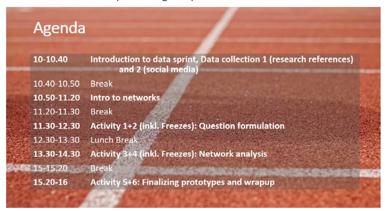
Figure 1. Structure of the data sprint (as shown to participants, original slide deck)

made use of the "sprint" metaphor (with both the background and the "freezes"). The exact time slots were adopted during the sprint.